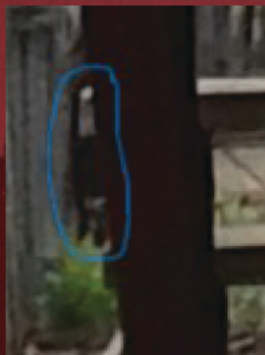
Nun Outside - ST Arnaud Convent

The Convents spirits have shown the team and me so much and reminded us of what we may have forgotten. This was why it felt like home.